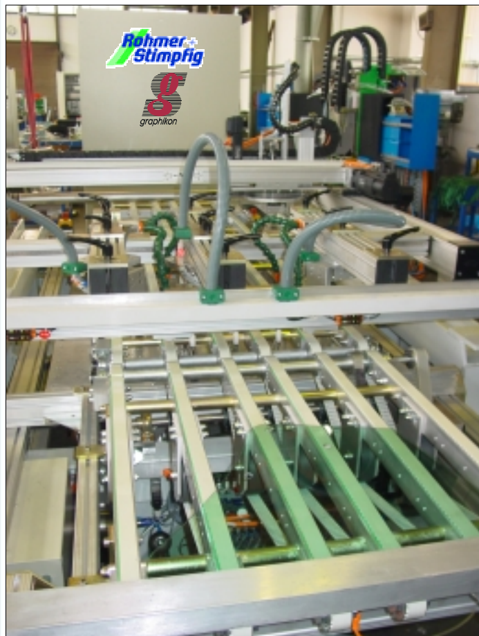
Chip Detector in operation